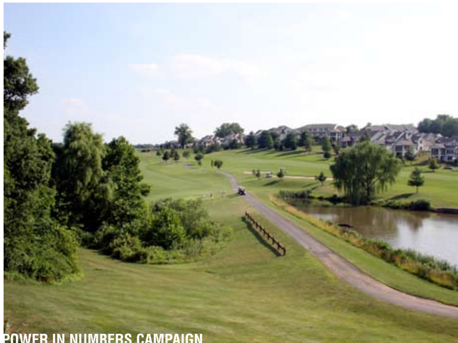
POWER IN NUMBERS CAMPAIGN