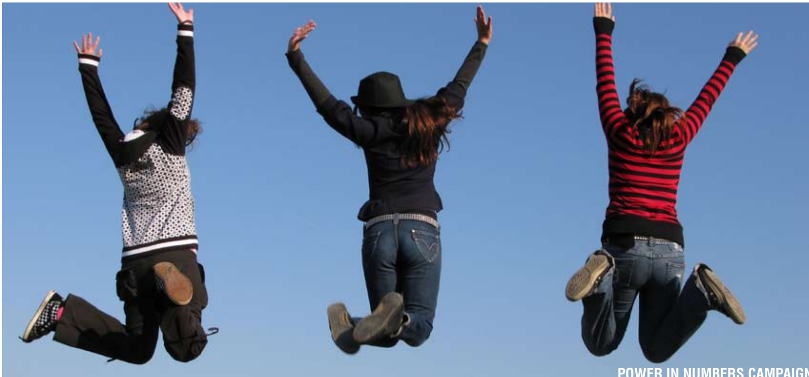
POWER IN NUMBERS CAMPAIGN

FOLLOW THIS EXCITING CAMPAIGN ONLINE AT WWW.CHILDRENDESERVEACHANCE.COM