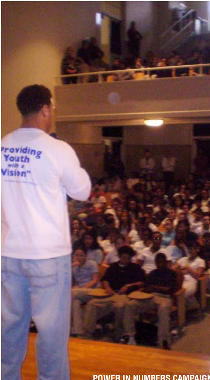
POWER IN NUMBERS CAMPAIGN